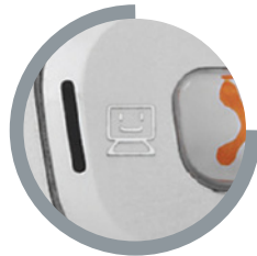
One-Touch Instant Messaging Button for Quicker Login