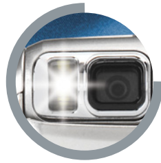
Flash and Lens Rotate 180° for Both Still Photos & Video

1 Depends on unused memory 2 Resolution affects options 3 Resolution, color & quality affect storage capacity