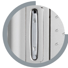
Left Side Keys to Flip Viewfinder Image